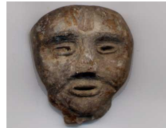
Detailed human effigy from a ceramic smoking pipe.

As you may know, the Mantle site was an early 16th century ancestral Wendat (Huron) village. The village covered 9 acres and over 150,000 artifacts have been excavated from the site. At its busiest, there may have been 2000 people in the village. The site housed close to 70 longhouses, surrounded by extensive corn fields. Close to 50% of the inhabitant's diet was maize and each inhabitant was consuming close to a pound of corn each day – that's a lot of corn needed by the village for survival. Over time, the land would have been depleted of nutrients needed to produce the corn – along with depletion of small game animals in the area - and so the village would have moved on.